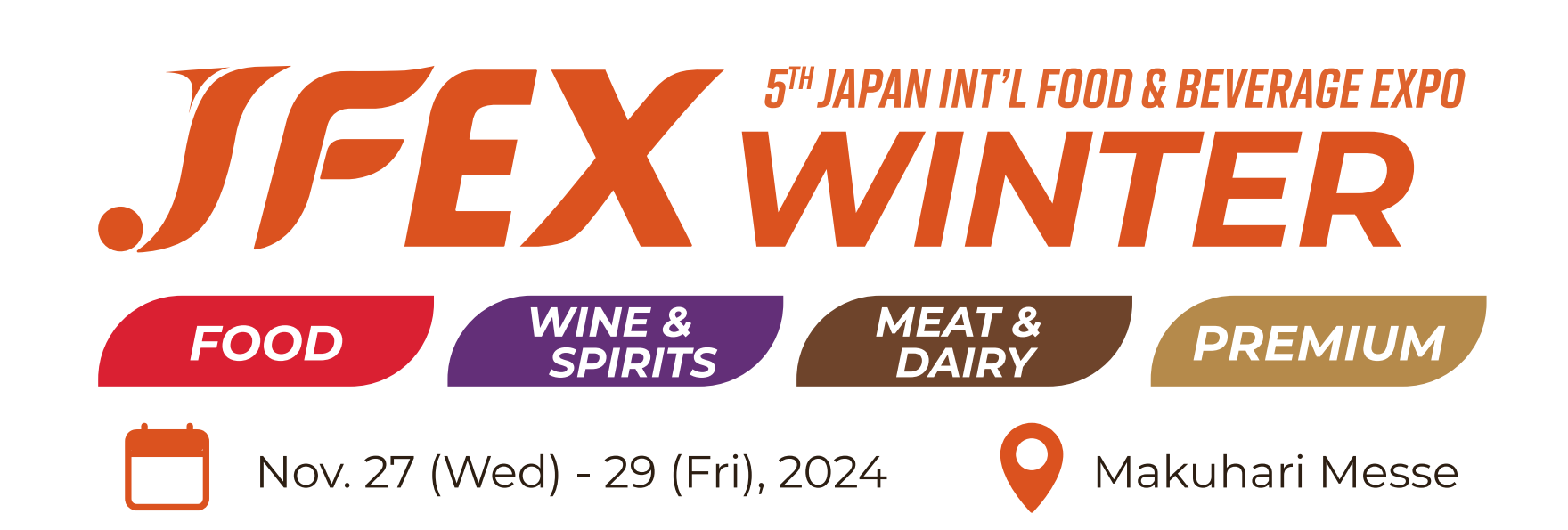
Exhibit with us >